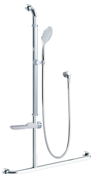
Drawn LH (Left Hand)